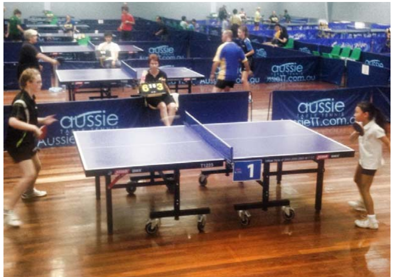
Table Tennis Rule Change